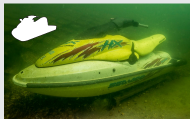
JET SKI SUNKEN JET SKI

Beach Type Entry and Exits Pontoon (Entry Only) Concrete Anchoring Points On-site Cafe, Shop & Air Fills Changing Rooms with Hot Showers Disabled Facilities Free Public Wi-Fi