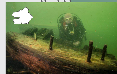
BARGE C17TH BOW SECTION